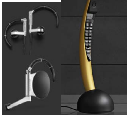
BeoCom 1, A8 Earphones, Earset 2, BeoCom 2

Get started with the Sound Environment now! $799 will get you an entire system that is absolutely great for dorm room, office, den or anywhere you need a compact system.