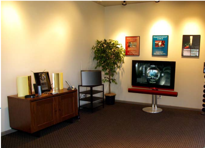
New front area in the Lincoln store